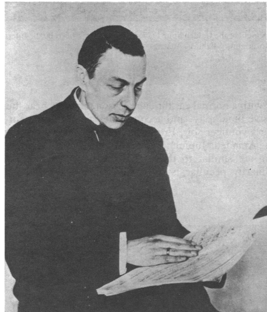
Sergei Rachmaninov (1913).

Marfan's syndrome is a hereditary disarrangement of connective tissue affecting one or more of three systems: skeletal, visual, and cardiovascular. 3 Of the skeletal features, the most characteristic are